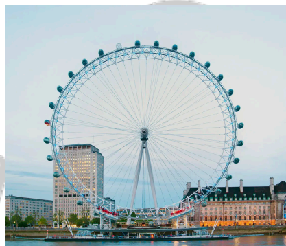
_____ (A F_____ w_____ [摩天輪])

Activity 2: Where are we going today? Listen and fill in the blanks in the map below with the words given in the word bank.