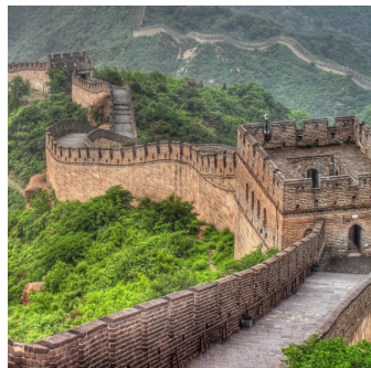
The Great _____