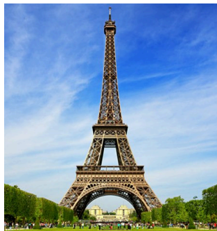
The Eiffel _____

Activity 1: What are some of the famous landmarks [地標] in the world? Fill in the blanks below.